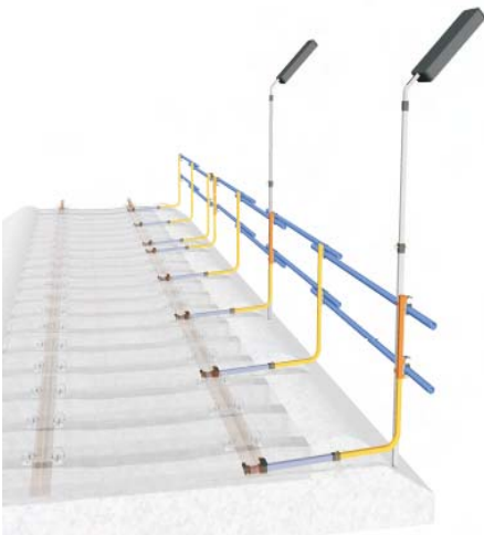
Keep Open Line Clear