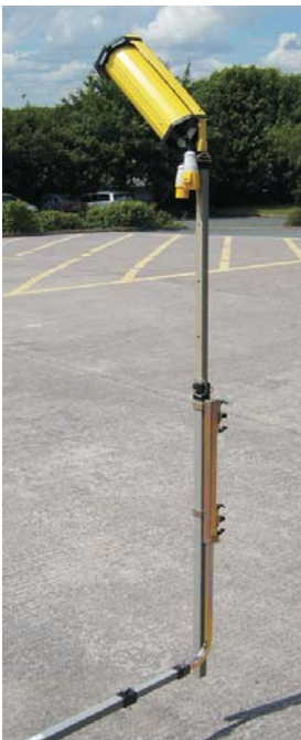
Parallel lighting keeping headroom clear